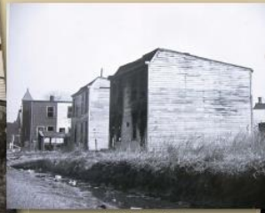
800 Block of N. Alfred Street