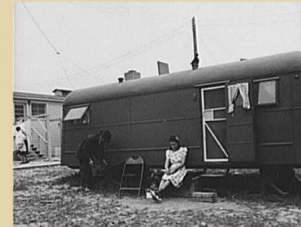
"Arlington, Virginia, FHA Trailer Camp Project for Negroes, Single Type Trailer, April 1942"

He composed over 700 songs, including "In the Evening by the Moonlight," "O Dem Golden Slippers," and "Carry Me Back to Old Virginny", the official State Song of Virginia from 1940 until 1997.