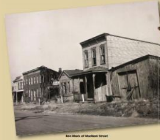
800 Block of Madison Street