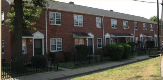
James Bland Homes Building Type D (1959) 161-111 North Patrick Street

Funded by the U.S. Public Housing Administration and built by the Alexandria Housing and Redevelopment Authority (ARHA) between 1954 and 1959, the James Bland Homes was Alexandria's fourth public housing project and it more than doubled the city's stock of racially segregated public housing units intended for its African American citizens. Alexandria's public housing emerged from an effort to improve substandard or 'slum' housing associated with the President Franklin D. Roosevelt's New Deal of the 1930s. Many felt that the slums contributed to high crime rates and posed serious public health problems. The James Bland Homes project was preceded on the site by a World War II era federal Public Housing Authority trailer camp established in 1943 for African American residents of properties condemned during a 1941 program of slum clearance in downtown Alexandria. The establishment of the James Bland Homes required the condemnation of 57 parcels in an area known as 'the Hump'. Many residents of this historically integrated working class neighborhood fought to preserve or receive fair compensation for their homes.