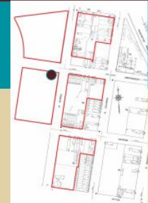
1912 Sanborn Insurance Map Sanborn Map Company