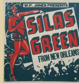
Silas Green Band Tent Show Black Show Photo