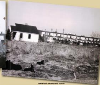
900 Block of Madison Street